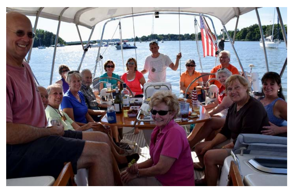
Sixteen Sailors in one cockpit!!