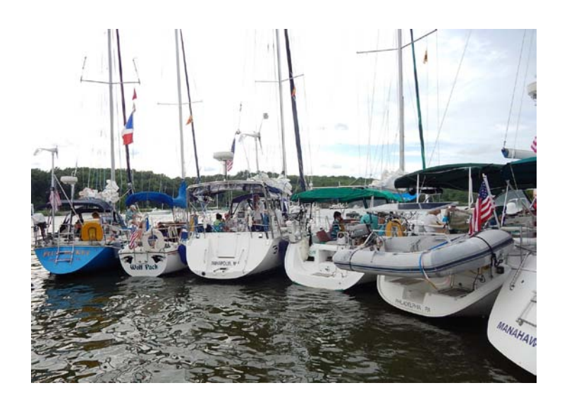
The RAFT is closed!